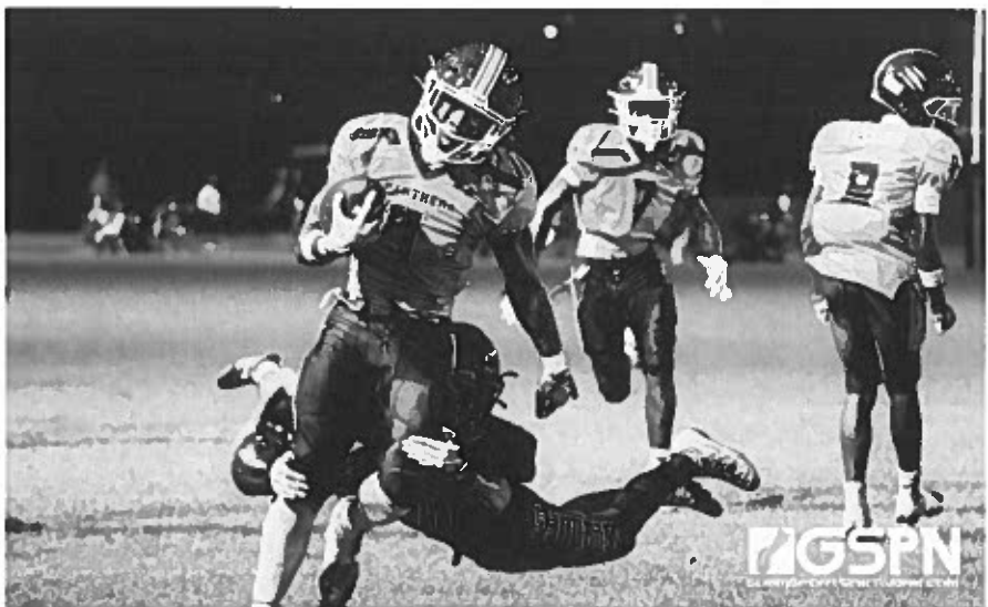
Panthers carrier breaks the tackle of the Islanders.

With momentum on their side and a fire lit beneath them, the Panthers are poised for a fierce playoff showdown.